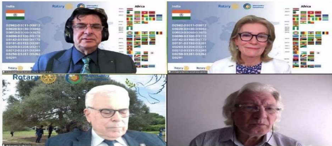
ICC Signing Africa/ India - 2 April 2024