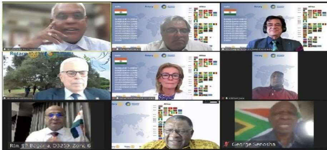
ICC Signing Africa/ India - 2 April 2024