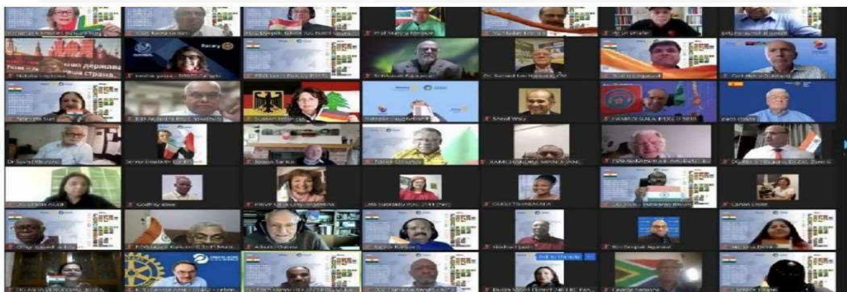
ICC Signing Africa/ India - 2 April 2024