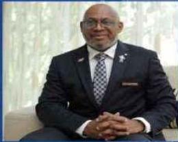
PDG Christophe KOREKI RI ICC Executive Council Africa Expansion Region 26